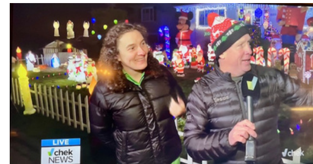
CHEK News covered the Cedar Ave Christmas Display that raised food and funds to support The Kitchen. Dec 2024